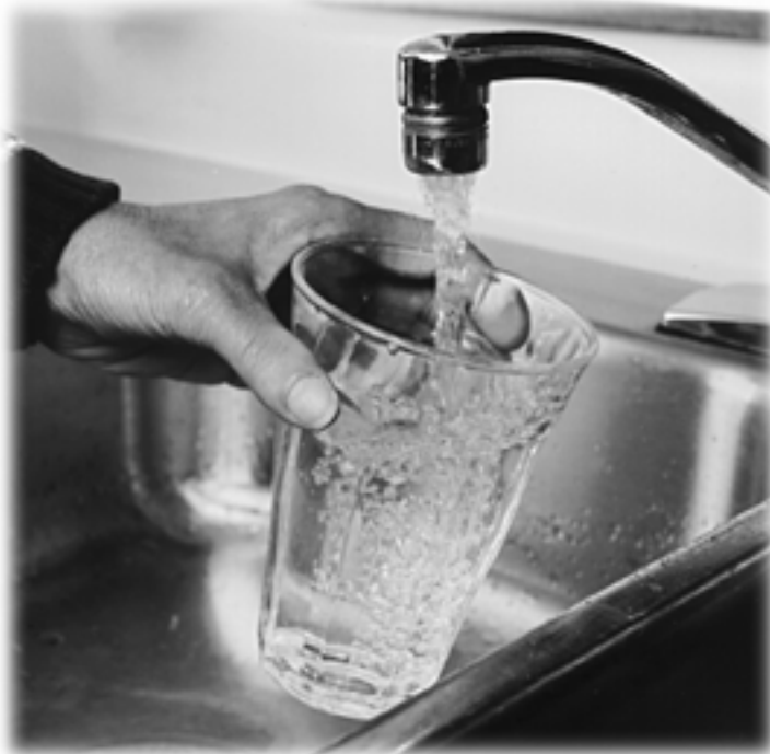
Letting the water run for 1–2 minutes is the easiest and cheapest way to reduce lead levels in drinking water. This method is effective for reducing lead levels below 15µg/L in more than 90 percent of cases.

Homeowners who have a groundwater well with a submersible pump may want to have the pump checked. If some of the pump's